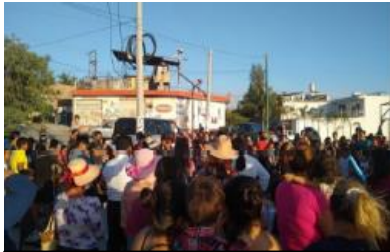
Over 400 people attended this open-air service.

One of our exciting ministries is our open-air, street-preaching services. Each Saturday, we take a couple van-loads of members to a different unreached area. We divide up with megaphones and flyers and announce the upcoming meeting. One Saturday, we held three of these services, and I was able to preach to over 900 people outside that day. Many people from these meetings come to our church to make public their professions of faith in Christ. The purpose of these meetings is to win souls, find new areas for routes, and find places to start churches in the future.