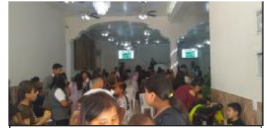
Our main church

We invite you to rejoice with us as we tell the tales of our missionary adventures. In the past two months, we have had over 1,000 people saved in our evangelistic efforts, and hundreds have been baptized. Many new members have also started helping in our various ministries. Glory to God!