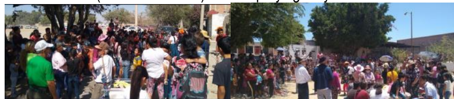
Our open-air preaching services

LOCAL CHURCHES MULTIPLYING LOCAL CHURCHES