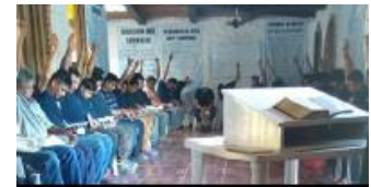
These men were saved in our rehabilitation ministry.

One of our exciting ministries is our open-air, street-preaching services. Each Saturday, we take a couple van-loads of members to a different unreached area. We divide up with megaphones and flyers and announce the upcoming meeting. One Saturday, we held three of these services, and I was able to preach to over 900 people outside that day. Many people from these meetings come to our church to make public their professions of faith in Christ. The purpose of these meetings is to win souls, find new areas for routes, and find places to start churches in the future.