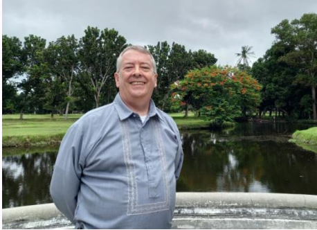
Look who is 65 now!

“Faithful is he that calleth you, who also will do it.” (I Thessalonians 5:24) Recently I have been reminded that we can plan and hope, but God changes our plans and expectations. However, the God we serve is a faithful God and deserves the glory for any good that comes from our work.