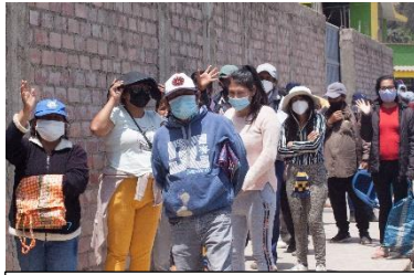
Lines outside the door