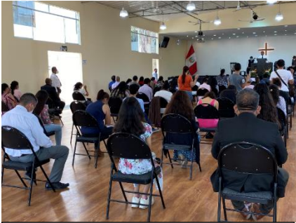
One of our three weekly Sunday services