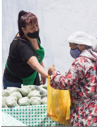
Giving food baskets