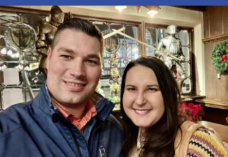
Christa and I celebrated seven years of marriage at a restaurant in Milwaukee.