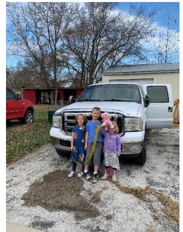
Saying "Goodbye" to our truck