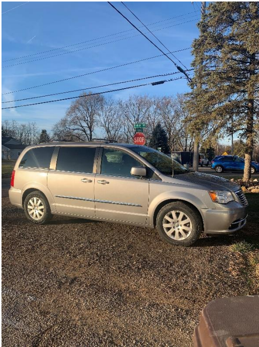
Our new vehicle for deputation—thank you to Manitou Road Baptist Church and our home church!