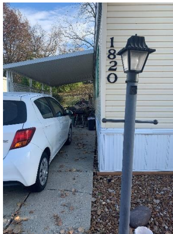
Esther out door blitzing