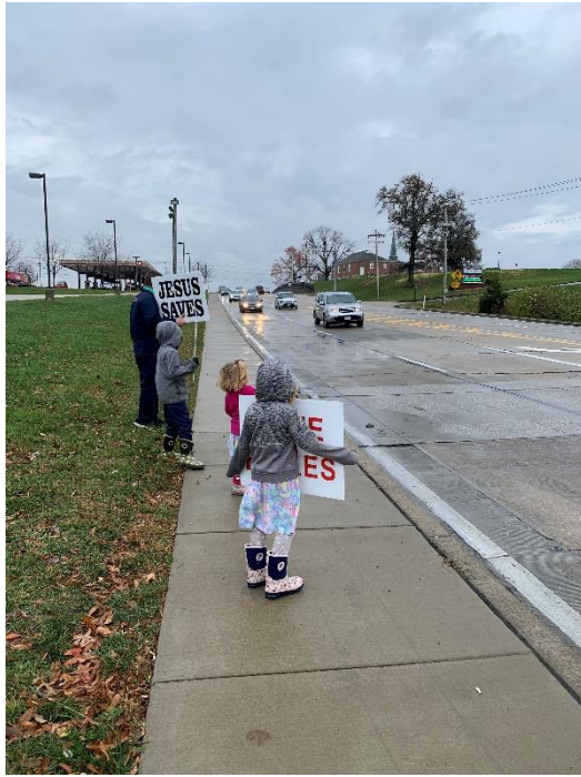
Holding "Free Bibles" signs out by the street