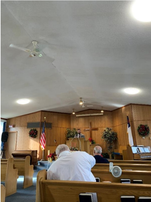
Presenting and preaching at Jackson Baptist Church in Jackson, Michigan