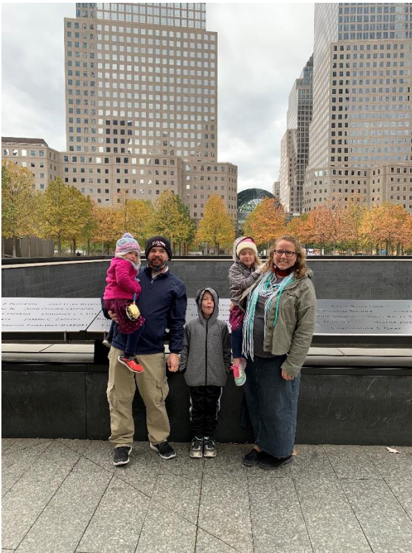
Visiting the 9/11 Memorial in New York City