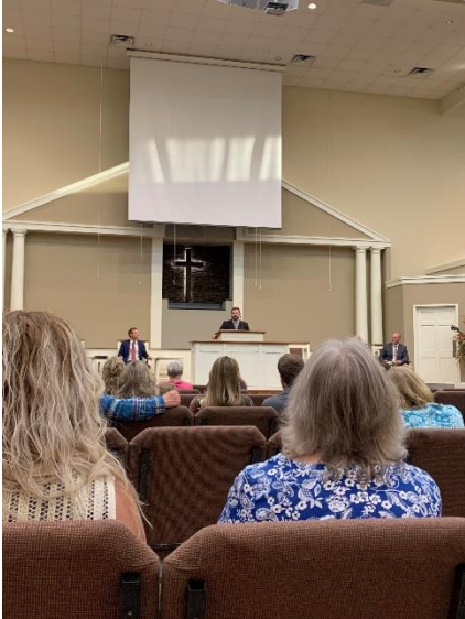
Presenting at Bailey's Grove Baptist Church