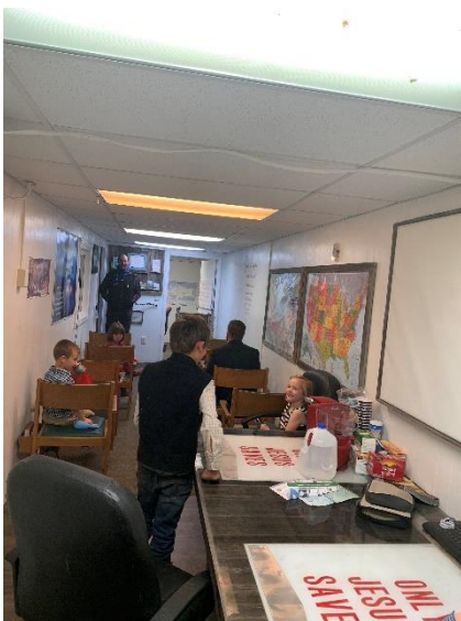
Enjoying learning about the Truck Stop Ministry at Cornerstone Baptist Church