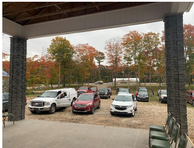
Getting ready to preach to Drummond Island Baptist Church in their cars!