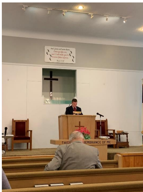
Preaching at one of our supporting churches, Battle Creek Baptist Temple, for their midweek service