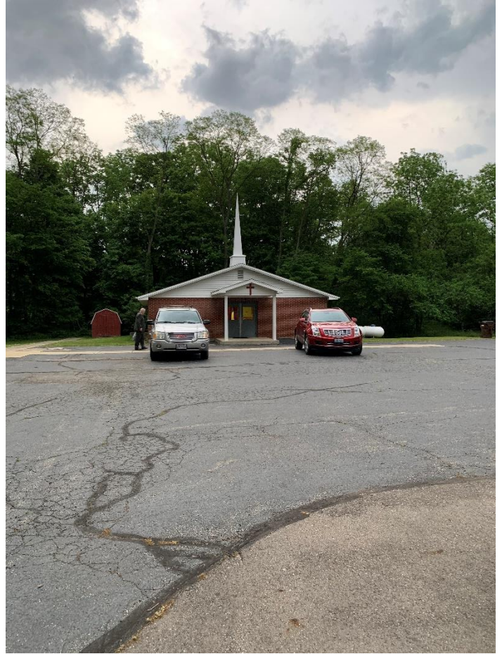
Leaving church at Calvary Baptist Church of West Alexandria, Ohio