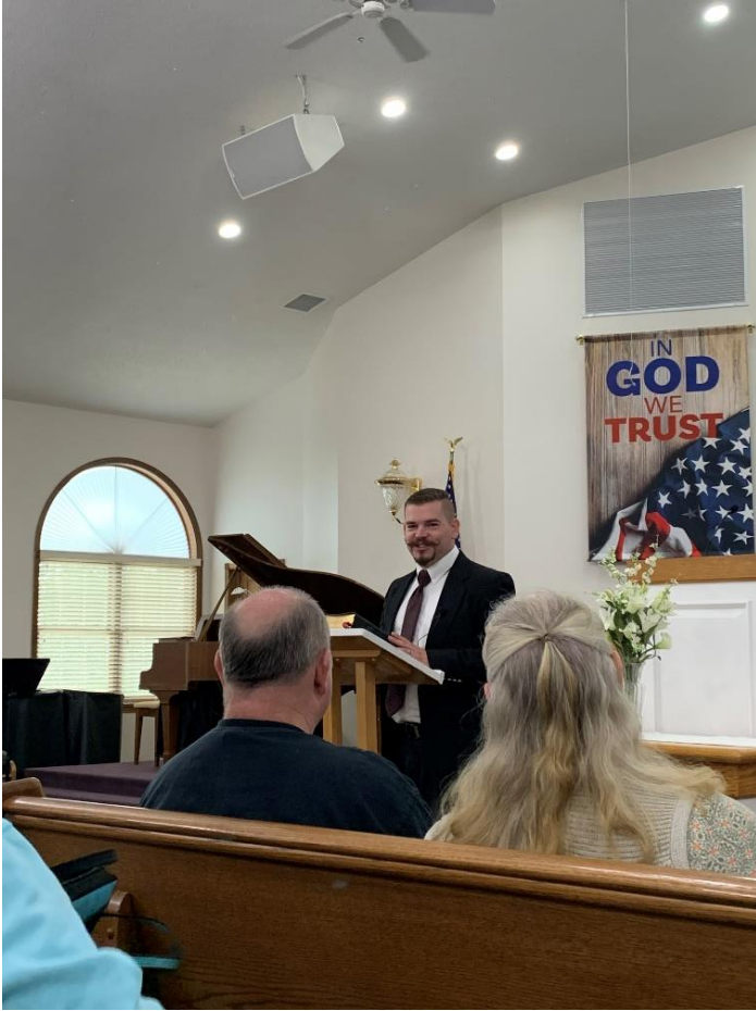
Presenting our ministry at First Baptist Church of Goodrich, Michigan