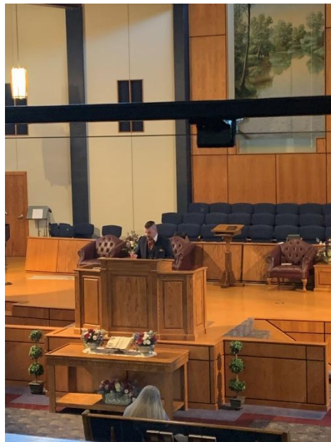
Preaching at Moraine Heights Baptist Church of Dayton, Ohio