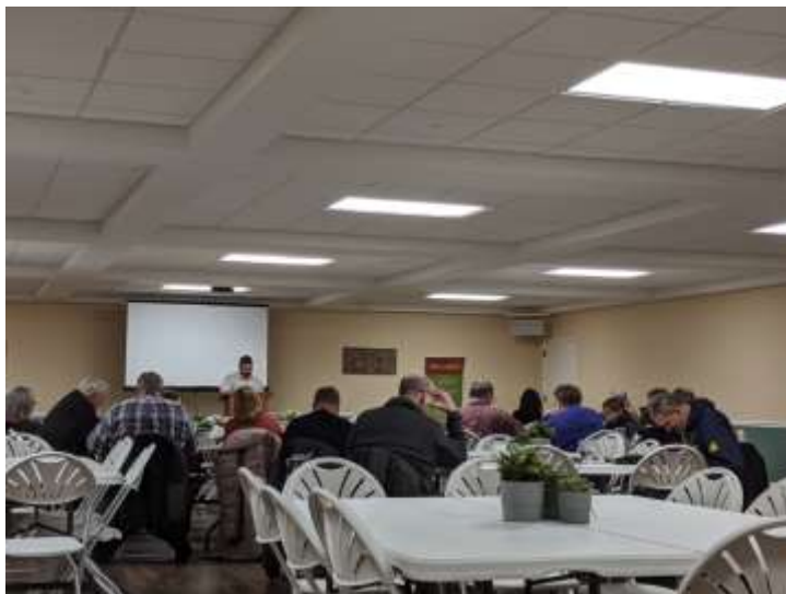
Blessed to fill in to preach at our home church's RU program