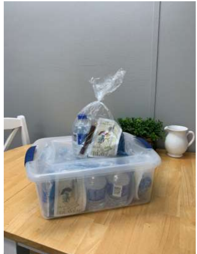
Homeless Ministry Tote— Water Bottle, Slim Jim, Chex Mix, and Gospel Tract