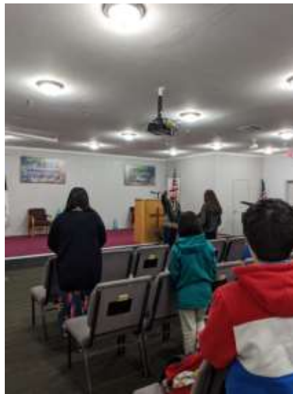
Blessed to teach the children in chapel at Stockton Baptist Church