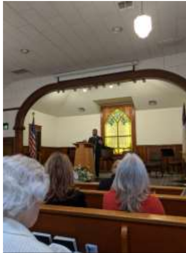
Preaching at Big Valley Bible Baptist Church, Lodi, California