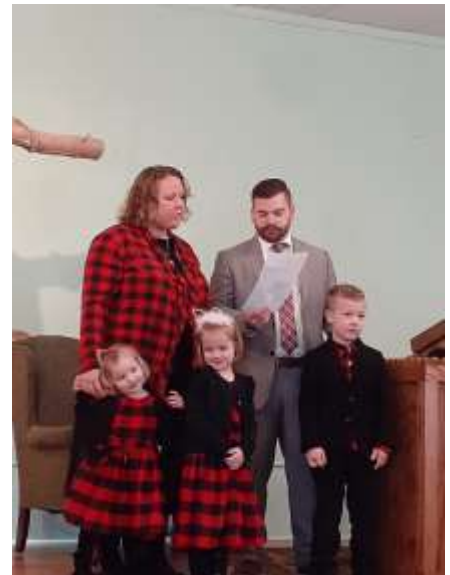
Our family singing together in church