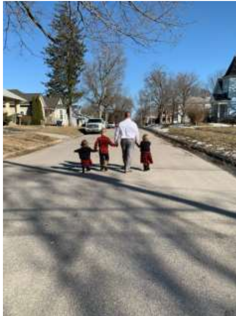
Walking together to the next street in town to invite and share the Gospel with others