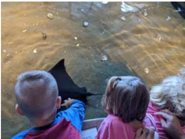
Above: Thank you to Central Coast Baptist Church for allowing us to go to the Monterey Bay Aquarium! The kids touching a stingray.