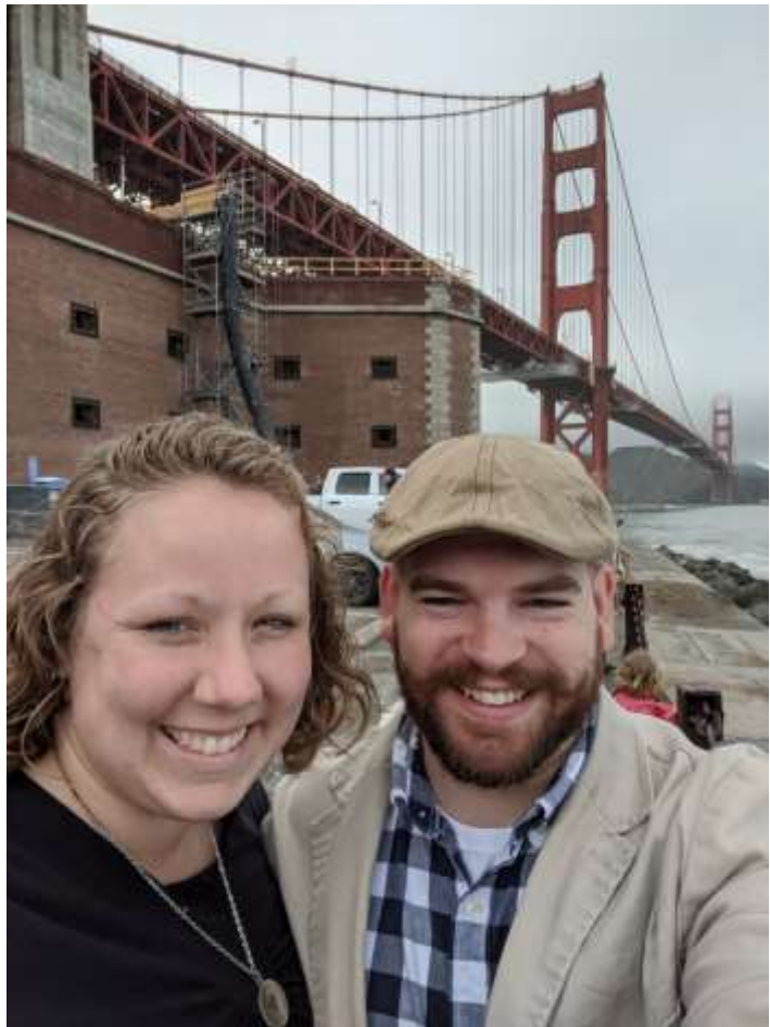
Right: Thank you Arlington Baptist Church for taking our family to see the Golden gate bridge