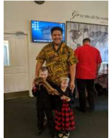
Upper Left: Our kids sang at the Nursing Home Ministry between services. Upper Right: The kids were excited to see a traditional Samoan during the International Sunday services!