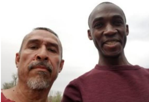
Witnessing to Sylvestre

"Therefore, my beloved brethren, be ye steadfast, unmoveable, always abounding in the work of the Lord, forasmuch as ye know that your labour is not in vain in the Lord." (I Corinthians 15:58)