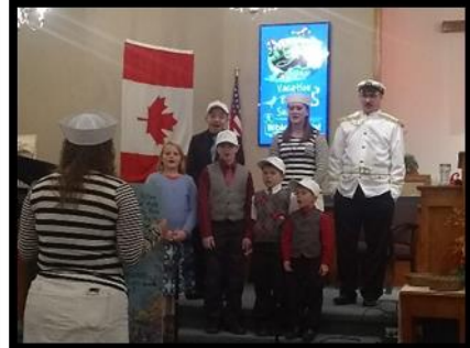
Our children participated in churches along the way.