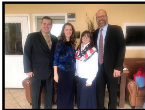
We visited 30 churches and spent time with great men and women of God.