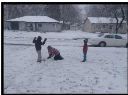
For the first time, our children saw and played in the snow.