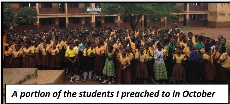
A portion of the students I preached to in October

As I met with some students one on one last Friday, it was so encouraging to have 12 of them tell me that they had trusted Christ as their Saviour either as a result of my preaching or through the salvation booklet they completed! Please pray that God will use us to bring many students to Christ and to help establish them in the faith through this ministry. Pray also for more laborers to preach in the schools here—the harvest is so plentiful!