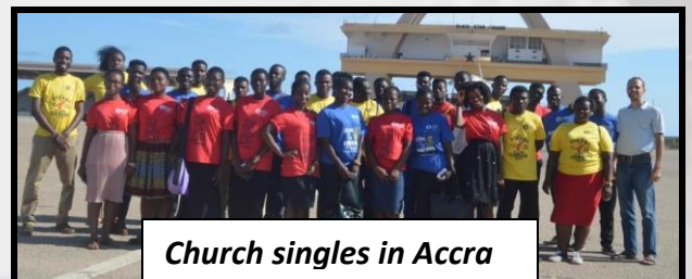
Church singles in Accra