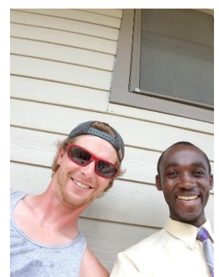
A young dad