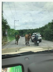
Typical road hazards