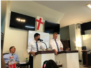
Preaching in the main service