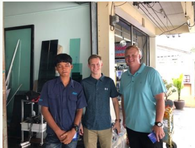
"Pizza" trusted Christ