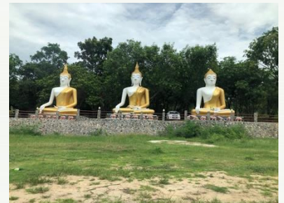
Statues of Buddha