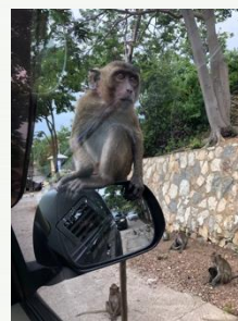
This monkey needed a ride