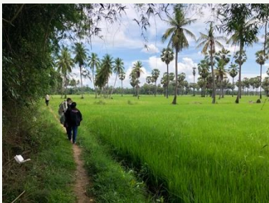
Walking through the rice fields to collect the idols