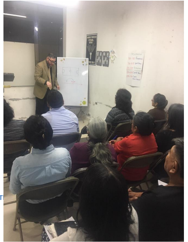
Abe teaching the child rearing class at IBI Chorillos