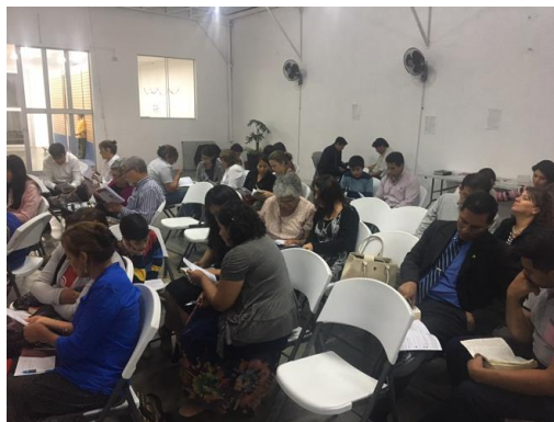
Discipleship class at IBI Surco