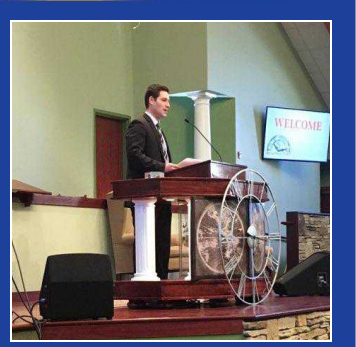
First time presenting!