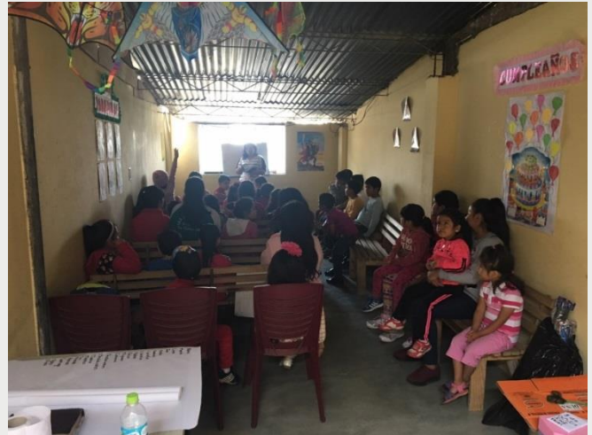
Children starting to arrive for Goldfish Sunday