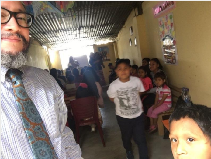
The children wanted to help me bag the goldfish!