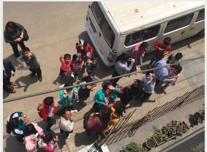
A small group of children with their goldfish