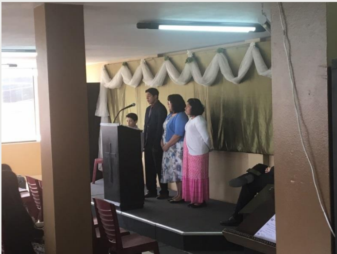
My family singing before the Sunday service