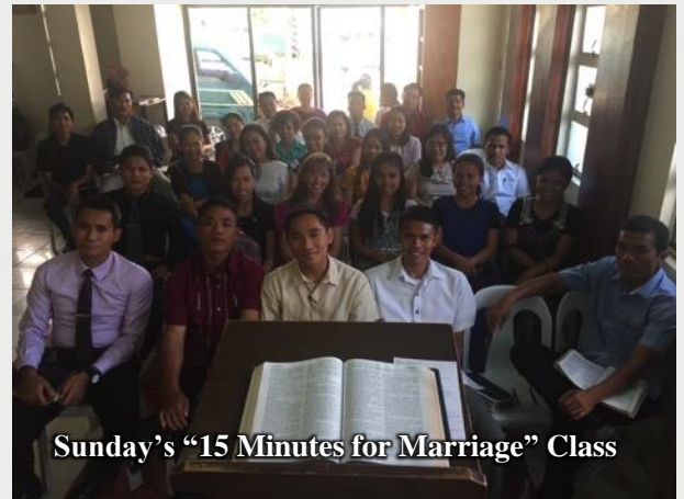
Sunday's "15 Minutes for Marriage" Class