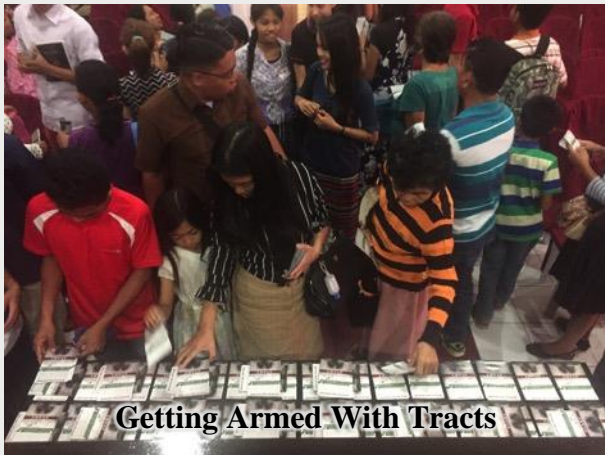
Getting Armed With Tracts