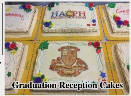
Graduation Reception Cakes