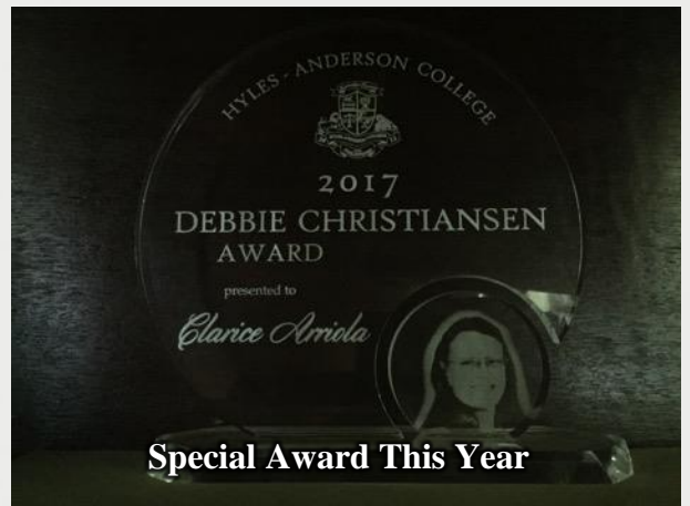
Special Award This Year