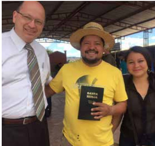
Visitors with New Bibles

In the words of William Carey, we are attempting great things for God and expecting great things from God, as we celebrate 40 years of sowing the Seed in 2017. We have a lot going on as we are trusting the Lord to enable us to ship a container every month this year! We have already shipped 3 containers to the Faroe Islands, India, and Lebanon. We are currently raising funds for containers to the Philippines, Papua New Guinea, Suriname, and Germany! The Lord blessed bountifully during our Heralding in Honduras mission trip. For more information please look inside our newsletter.