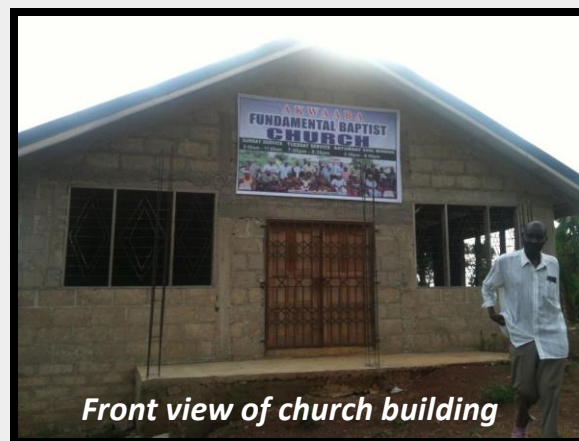
Front view of church building

We are so thankful to be meeting in our new church building! We just got a banner put up, which can be seen well from the main road. We are having visitors nearly every week, which keeps us having many prospects for soul winning and follow-up. We had our first visitor from Kumi two weeks ago (located two villages away from Berekuma)!