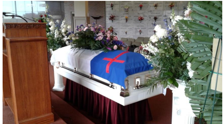
Debbie's Coffin Draped With a Christian Flag Made in the Philippines

When I left for the States in April, our church had already seen 2,887 saved and 129 baptized in 2016. The week after I left, IBC had their summer break Vacation Bible School outreach. Our college students and church members conducted 25 neighborhood meetings every day for 4 days and saw 803 different children attend and 482 saved. On the next Sunday, in spite of a power outage, over 300 attended the morning service; and 11 were baptized.