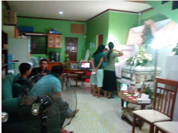
Memorial Service in Our Apartment