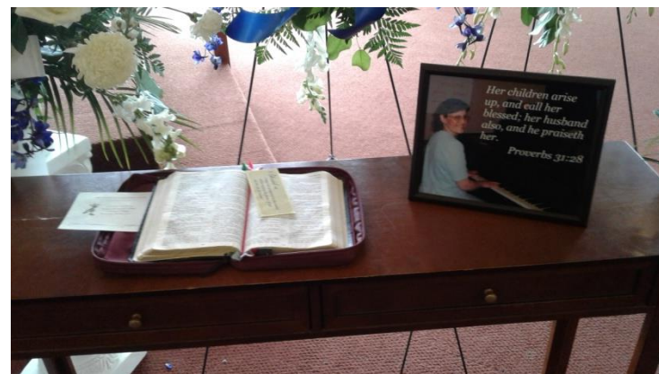
Debbie's Bible on display