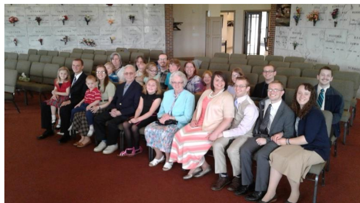
Family members present for the U.S. service