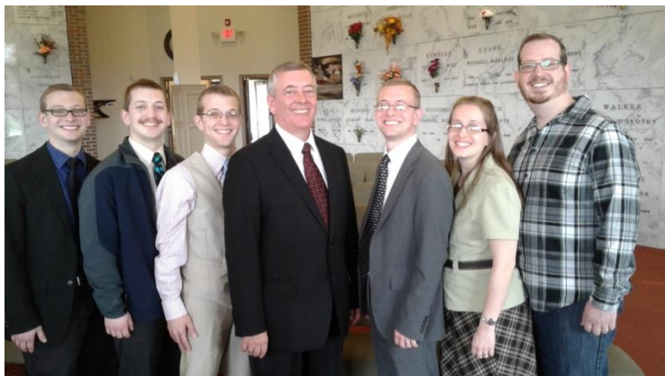
All the children were at the U.S. service.