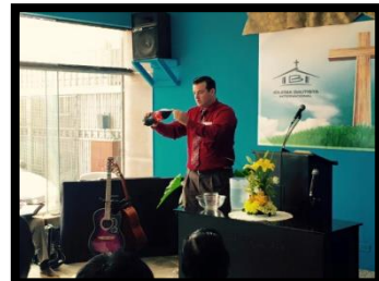
We enjoy great illustrations during the preaching.