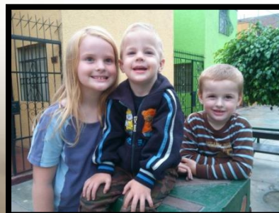
We are praising God for the three heavenly gifts who are still with us.

"AND SO WERE THE CHURCHES ESTABLISHED IN THE FAITH, AND INCREASED IN NUMBER DAILY." ACTS 16:5