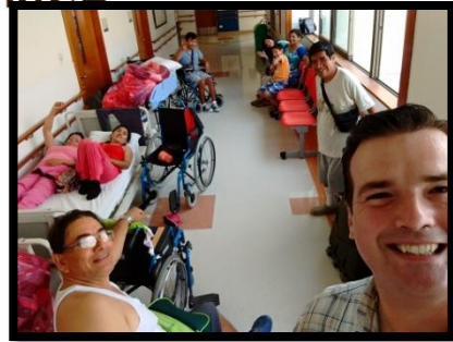
Nurses and security listened to our Bible study at the Hospital.