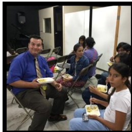
We enjoyed dinner after a great youth rally.