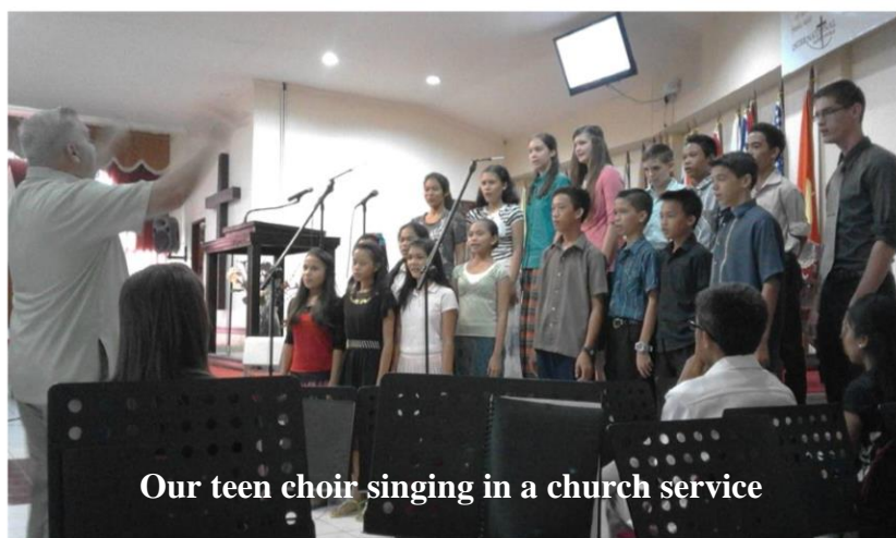
Our teen choir singing in a church service

In spite of all that has been challenging, the Lord has sustained us