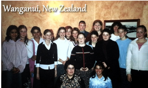
Wanganui, New Zealand