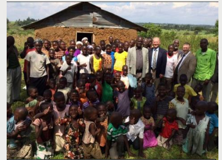
Growing church outside of Bungoma, Northwest Kenya