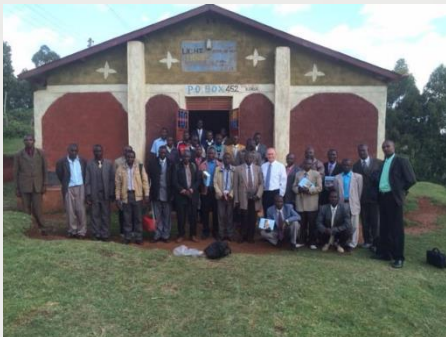
Pastors' School near Kilgoris, Southwest Kenya

Having recently returned from Kenya , we are more excited than ever about the ministry there and the fruit we are seeing. We are seeing more and more Kenyan national pastors realize their need for additional training , pastors who have previously received training of some sort but have not been taught many of the practical areas that will enable them to build their churches effectively.