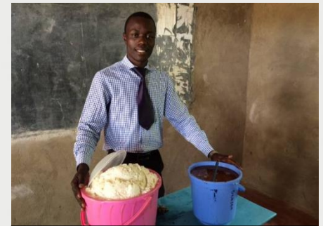
No one went hungry—there were bucket-loads of food!

the path of our van. I was sitting in the passenger seat and yelled out, as I thought we were going to hit him. To my relief, our driver managed to swerve dramatically and miraculously miss the man lying on the road . My relief was not for long, as we were surrounded by other motorcycle riders accusing us of hitting the man. I thought we were in big trouble until the