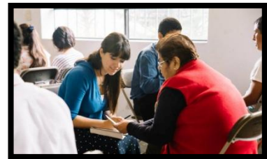
Ten souls were saved during our anniversary service.