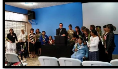
Nineteen moms were present for Mothers' Day.