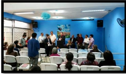
Thirteen dads were present for Fathers' Day.