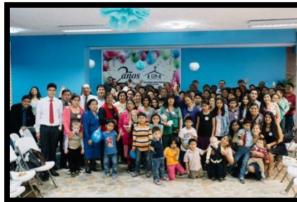
For our church anniversary, 148 were in attendance (all are not present in the photo).