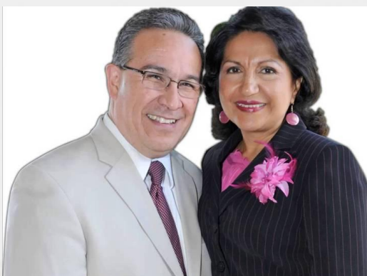
Argentina for Christ!

During November we had our national conference. Every year this conference gets bigger and better. This year we had 26 pastors present from different parts of Argentina. Some came from over 600 miles away. It was exciting to see hundreds of people who came to both the morning and evening sessions. Our church people donated many hours of time to paint the church, repair the bathrooms, and decorate the church. My wife was in charge of the decorations, and she did a great job. The church looked great!