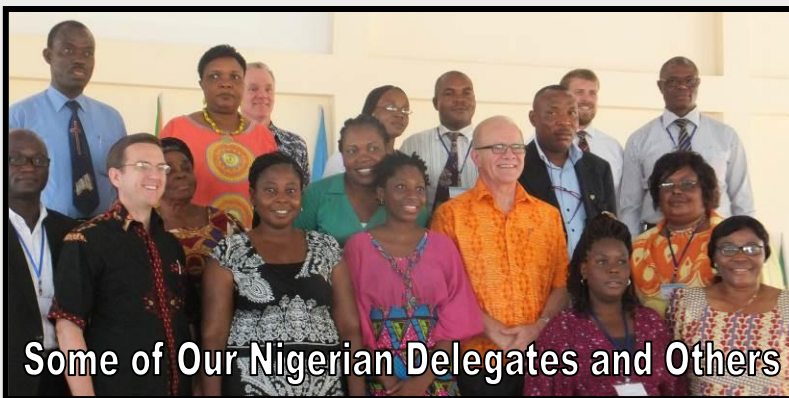
Some of Our Nigerian Delegates and Others