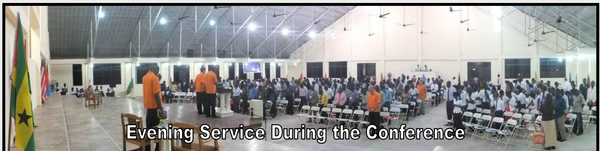
Evening Service During the Conference