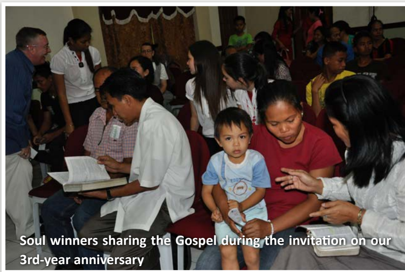
Soul winners sharing the Gospel during the invitation on our 3rd-year anniversary

We've been seeing great growth in our Sunday school. Attendances have been rising, and our folks are growing. Soul winners are training soul winners, and it has been great to see our church members helping others to grow. Our theme this year is "Grow With Us." We're teaching our soul winners to go further with their converts than just winning them to Christ and hoping they make it. We've put a growth-chart system in place so that a soul winner can immediately begin working with a new believer in taking steps of growth. Please pray as we implement this and make adjustments in the great work of discipleship.