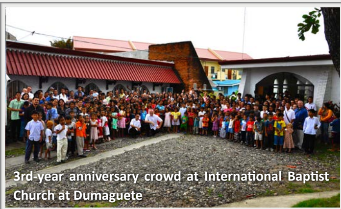
3rd-year anniversary crowd at International Baptist Church at Dumaguete