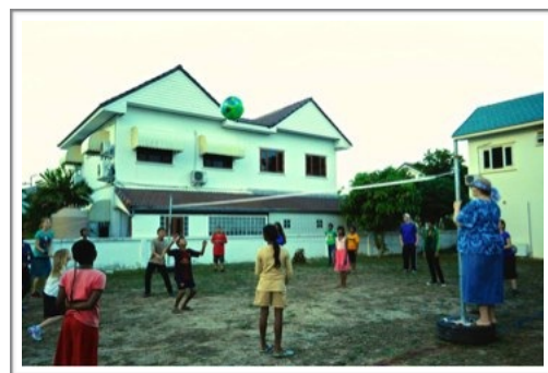
Volleyball at the youth activity