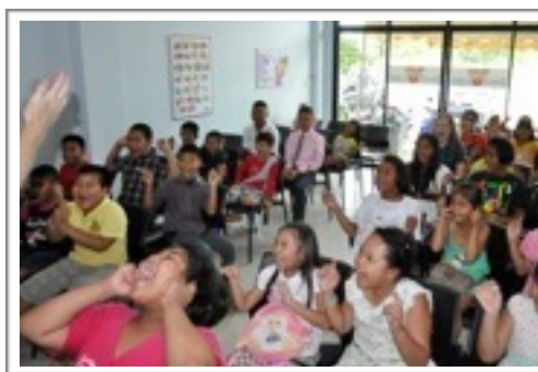
PACKED OUT in Junior Church