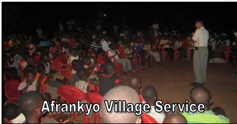
Afrankyo Village Service

I thank the Lord for giving me the opportunity to preach in two schools and three villages this month. I am also thankful for the workers and equipment that help me do the work more effectively. In these services 750 people heard the Gospel, and many decisions were made to receive Christ as Saviour.