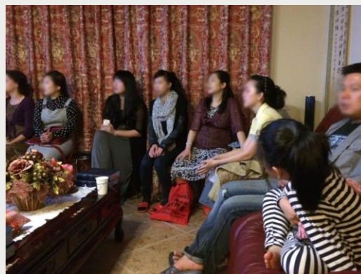
ONE OF OUR EVENING SERVICES