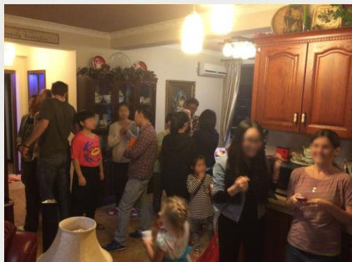
FELLOWSHIP BETWEEN SERVICES

Last Sunday evening we started a new Bible study for college students. We have had a number of team members attending an English corner at the local university for about five weeks. At these English corners we have already had many opportunities to clearly give the Gospel, and we have had several students attend some of our already existing