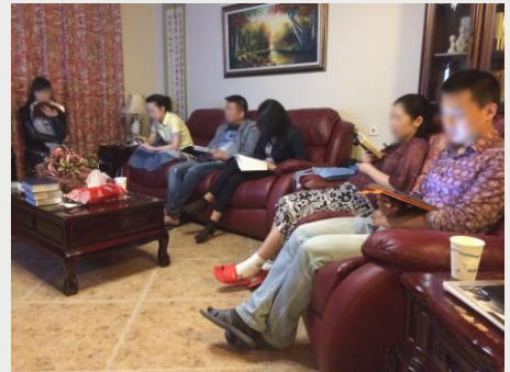
ONE OF OUR EVENING SERVICES

Our biggest concern now is simply having enough room in our apartments for all the students who want to come to our services. We are already making plans to divide and start more meetings at different times and at different places. We are also considering the possibility of renting an apartment near the college just for the purpose of holding Bible studies with these college