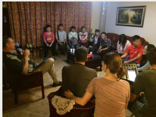
NEW COLLEGE STUDENT BIBLE STUDY

remaining seven students chose to trust Christ! Then, all four of them were also baptized! As the students were saying goodbye and getting ready to head out to catch the public bus back to the university, our regular members began to arrive for our 7:30 p.m. service! It was quite an exciting evening as our regular members were also able to meet the new believers who had just been baptized.