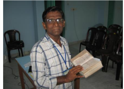
An Indian evangelist in Kolkata with his worn Hindi Bible and personal study notes