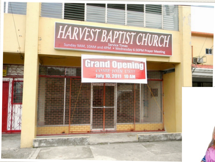
Our church building

Please pray for our Grand Opening service scheduled for July 10